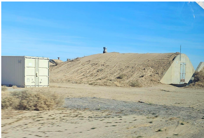
Abandoned munitions bunkers used for storage of illegal fireworks.

During the operation, they conducted 932 traffic stops for violations, issued 215 citations for illegal fireworks and arrested 3 individuals. Once confiscated, the fireworks are sent to Cal Fire to be destroyed. The confiscated fireworks are stored in abandoned underground munitions bunkers at the Mojave Air and Space Port. Cal Fire destroys approximately 220,000 pounds of fireworks per year at undisclosed locations in the desert.