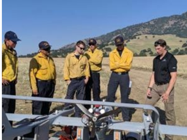
Kern County fire personnel examine a drone used to locate illegal fireworks

In comparison, the Fresno Fire Department in 2022 had 40% more calls for fires caused by illegal fireworks than 2021. The Fresno Fire Department, with the use of drones, teamed up with the Fresno Police Department to track down and cite people who were igniting illegal fireworks. This was in addition to hundreds of illegal fireworks seized in undercover stings leading up to the July 4 th holiday. Investigators cited 44 people for illegal fireworks.