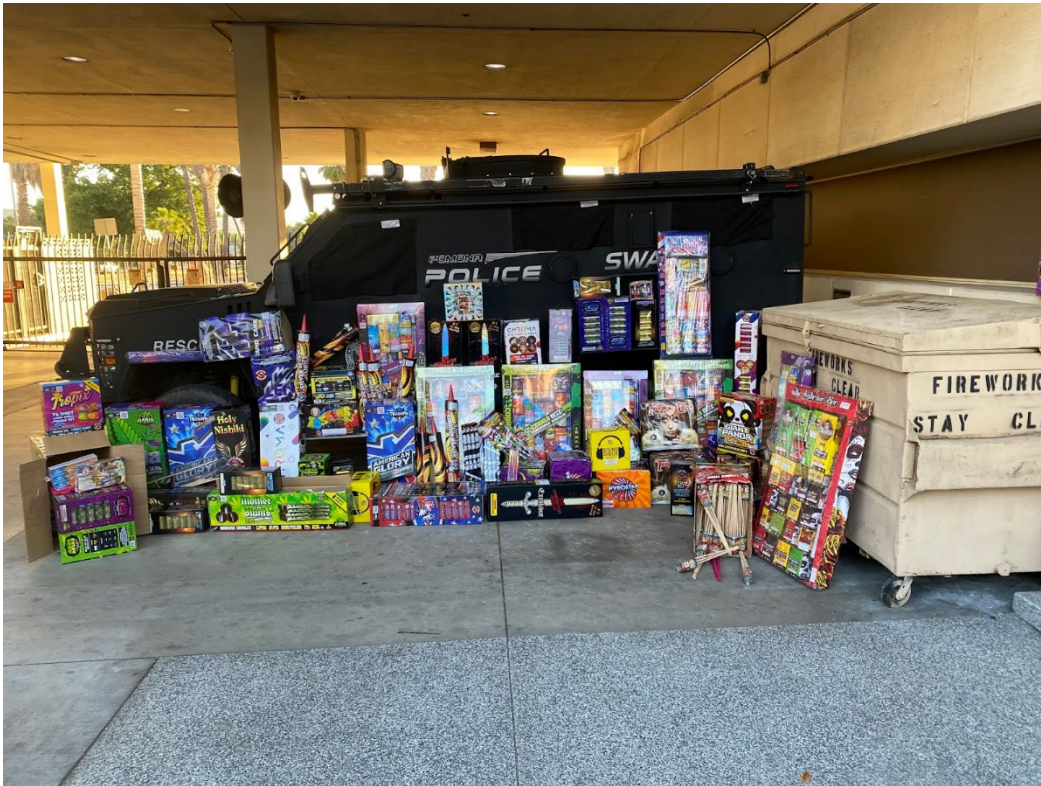
Confiscated fireworks from Pomona, California