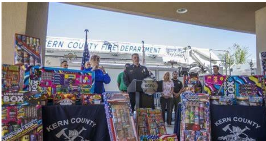
Confiscated illegal fireworks by Kern County Fire Department

Fire departments throughout California are developing plans with other city and county agencies to help minimize the use of illegal fireworks. Destruction of property by illegal fireworks is a misdemeanor but will become a felony if someone intentionally uses illegal fireworks to destroy property. Most of the illegal fireworks in California are transported from Nevada. The use of illegal fireworks poses a major threat resulting in firefighters responding to hundreds of fires and medical emergencies.