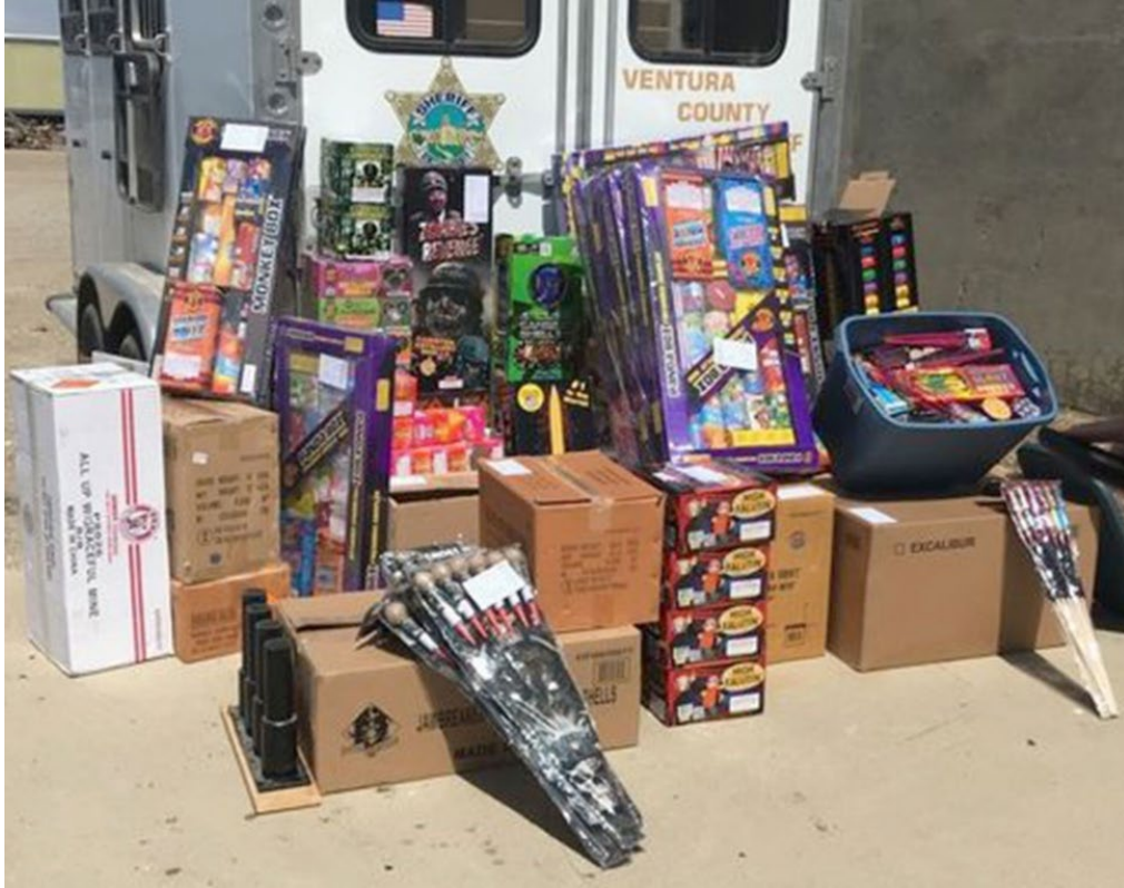
Confiscated fireworks from Ventura, California