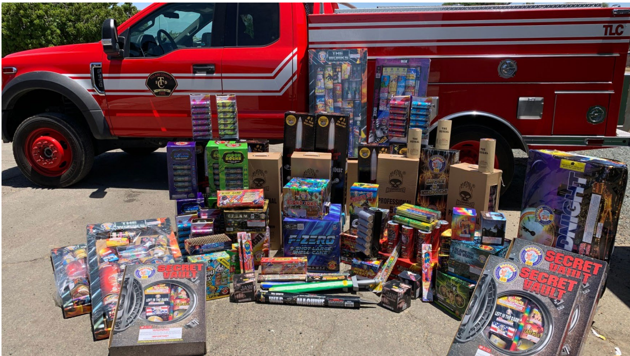
Confiscated fireworks from Tulare, California