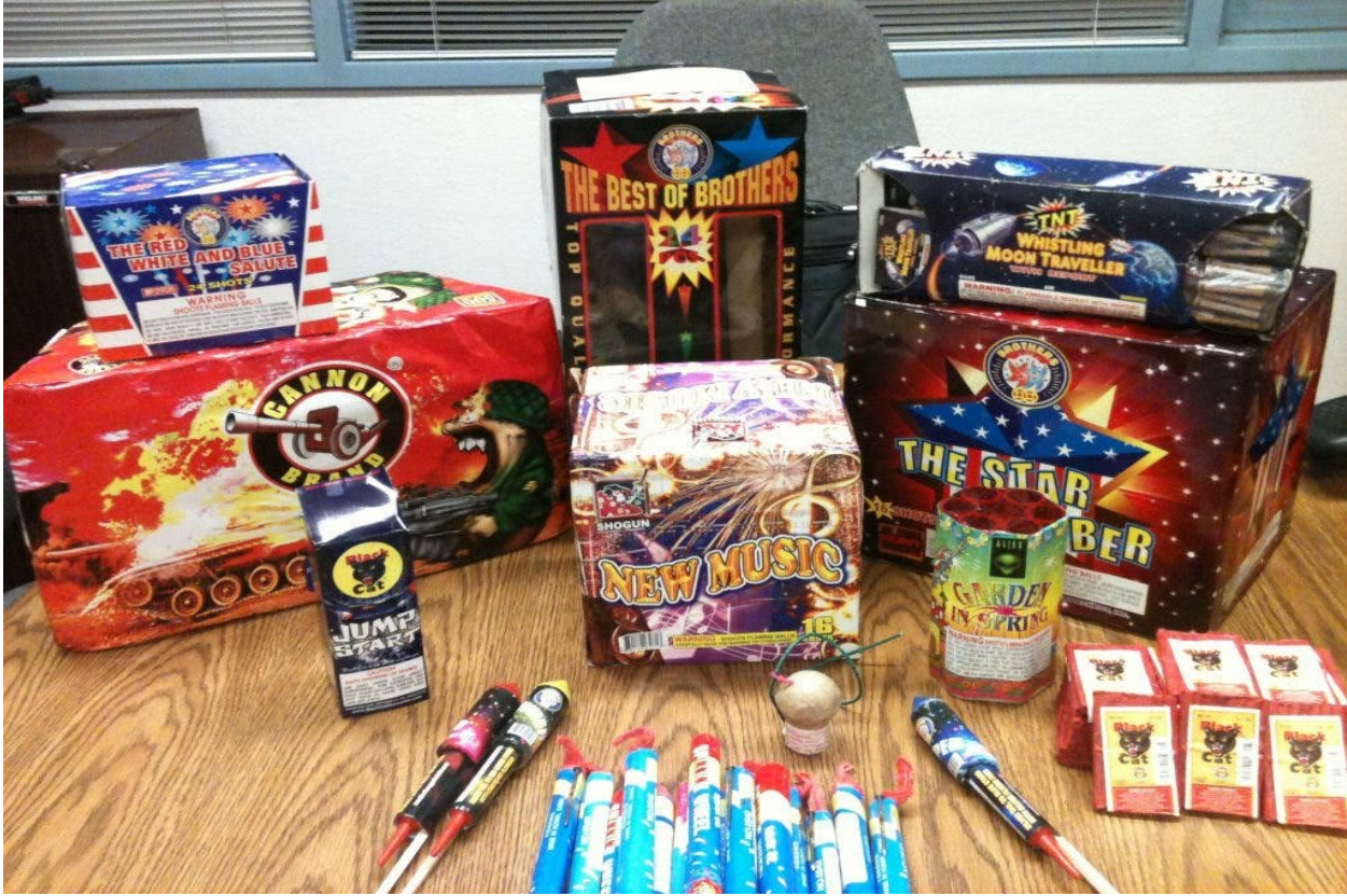
Confiscated fireworks from Gilroy, California