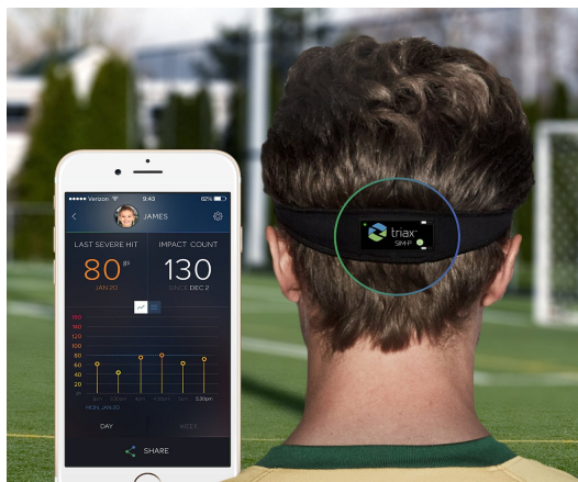
Triax Head Sensor with mobile monitoring

all over the United States employing the Triax technology. The cost at San Rafael High School was underwritten by several grants. 24