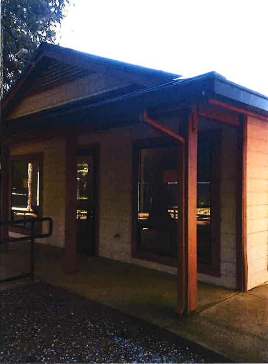
Pioneer Scout Hut exterior. The Scout hut is in need of exterior maintenance. Estimated man hours to prep and paint 240. Material costs $1,500.00