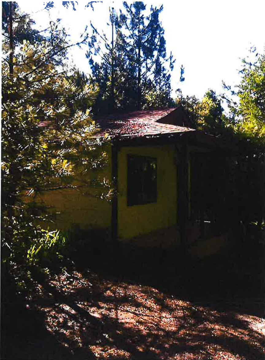
Demolition of old Sheriff's Up-Country Substation. This building has been needing to be torn down for at least 8 years. Estimated man hours 80. Materials, equipment and fees $5,000.00