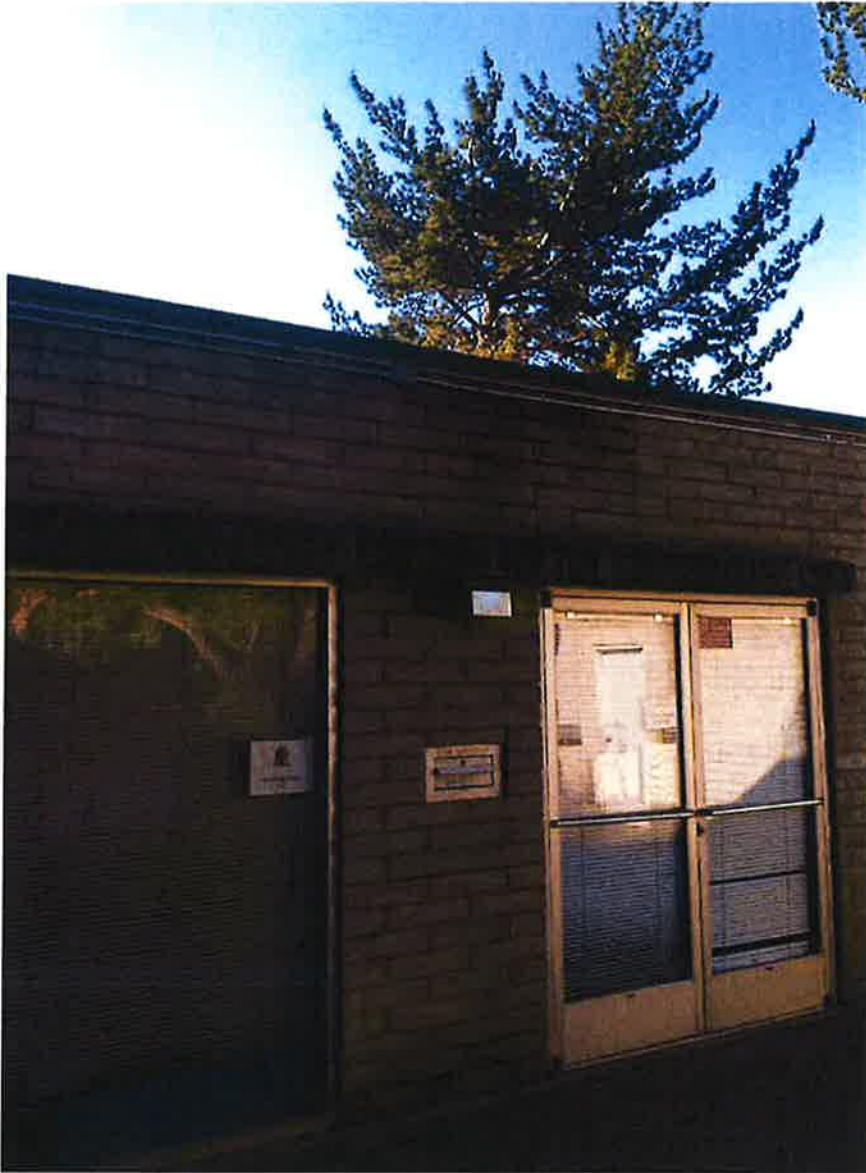
Main Branch Library Exterior. The exterior shell of the library is in need of maintenance. Scope of work includes pressure washing, replacing down spouts, sealing, painting & staining. Estimated man hours 400. Materials $2,000.00