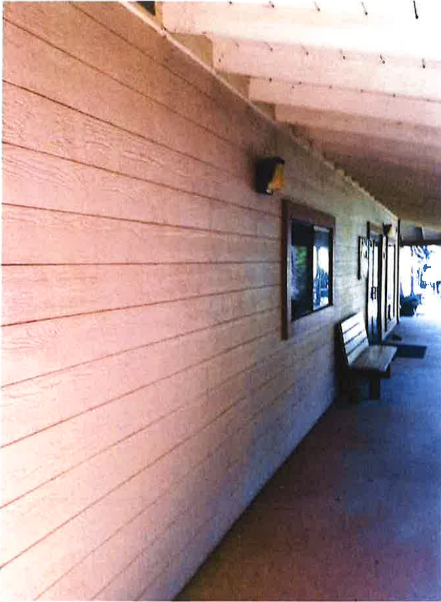
Pioneer Veterans Hall exterior. The Vet's hall is in need of exterior maintenance. Estimated man hours to prep and paint 240. Material costs $2,000.00