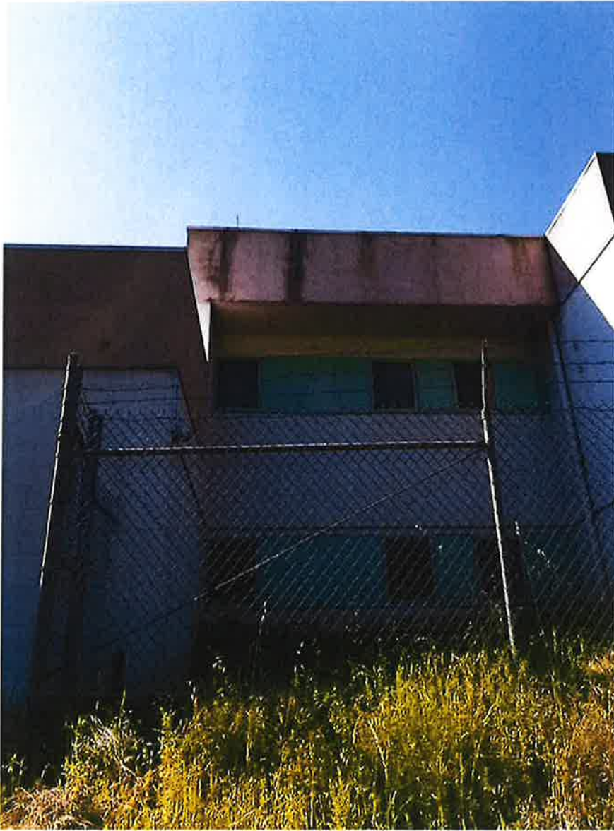
Sheriff's Admin/Jail exterior. The Sheriff's station is in need of exterior maintenance. Estimated man hours to prep and paint 960 (two months). Material and rental equipment costs $15,000.00