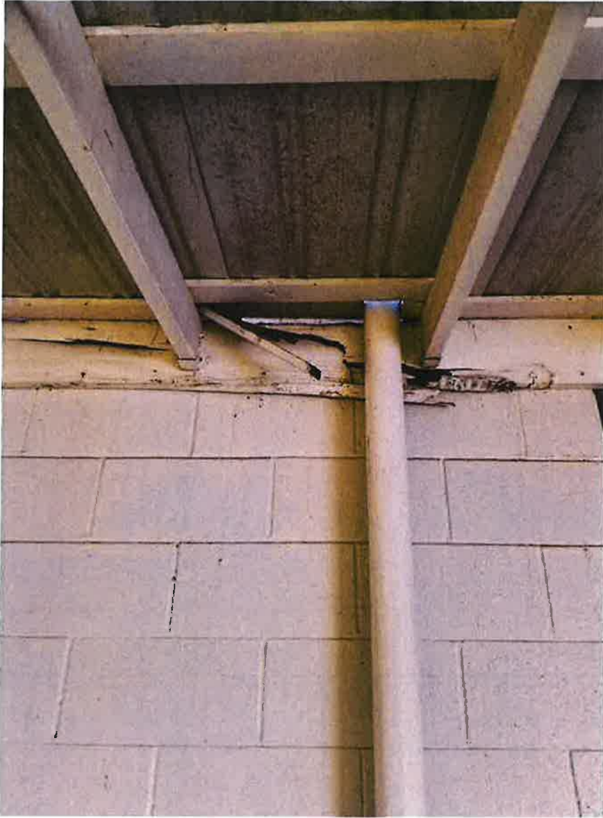
Sheriff's 911 Dispatch Entry Roof. This roof has rot and needs to be replaced. Estimated man hours 80. Materials, equipment and fees $3,000.00