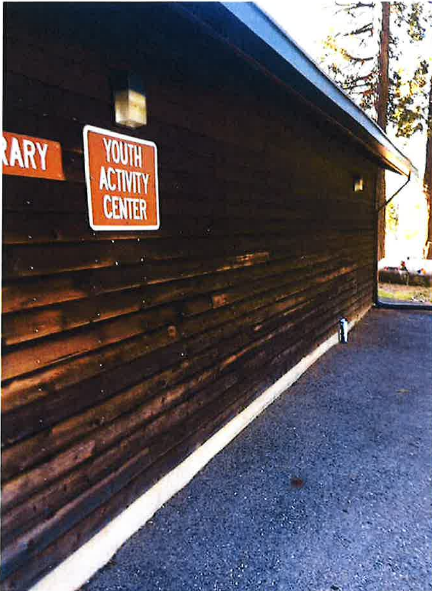
Pioneer Branch Library exterior. The branch library in Pioneer is in need of maintenance. Scope of work would include pressure washing siding, painting & staining. Estimated man hours 160. Materials $1,000.00