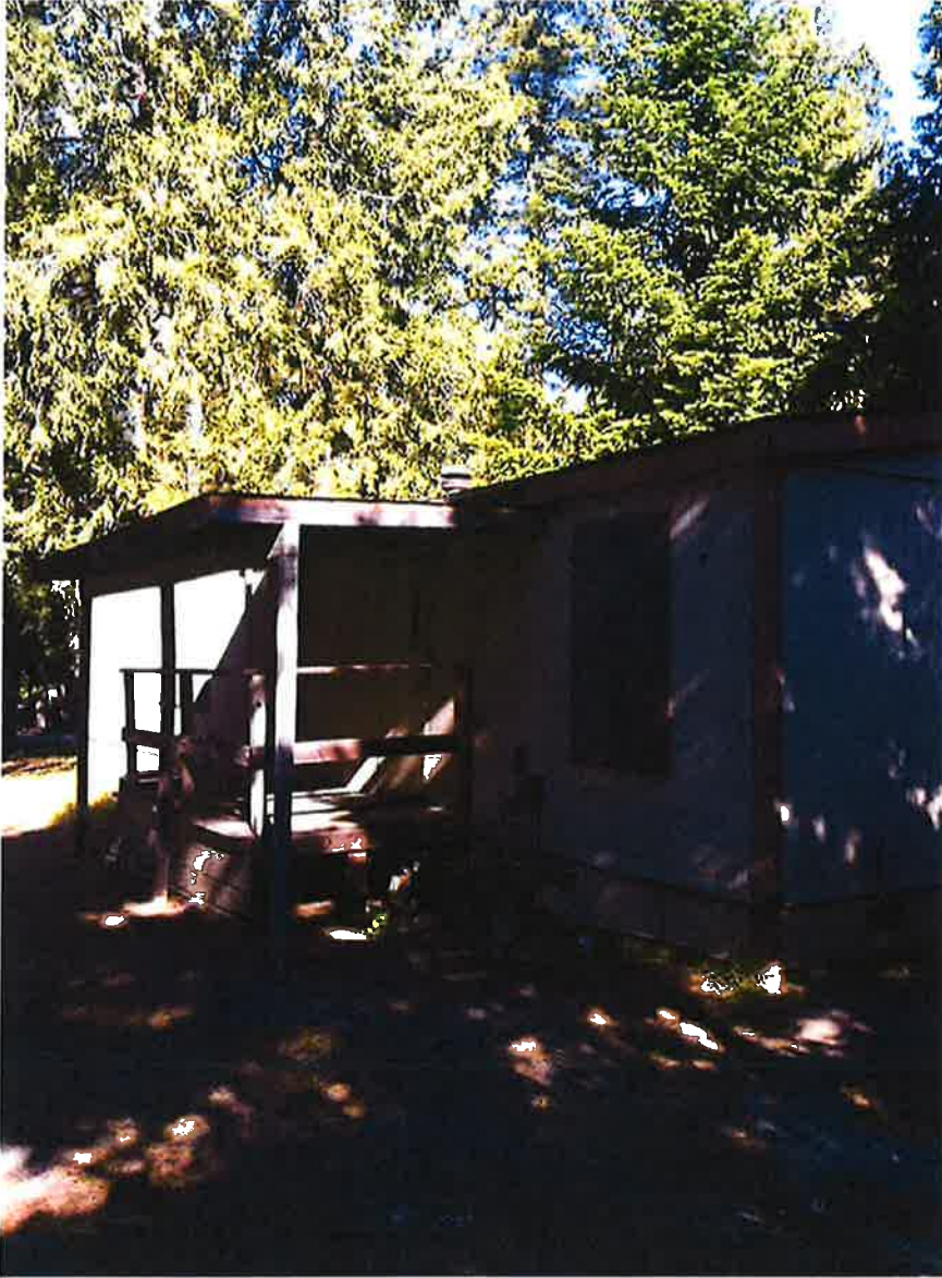
Old American Legion Up-Country Substation. This building has been abandoned by the American Legion at the Pioneer Park. It needs to be removed. Estimated man hours 80. Materials, equipment and fees $4,000.00