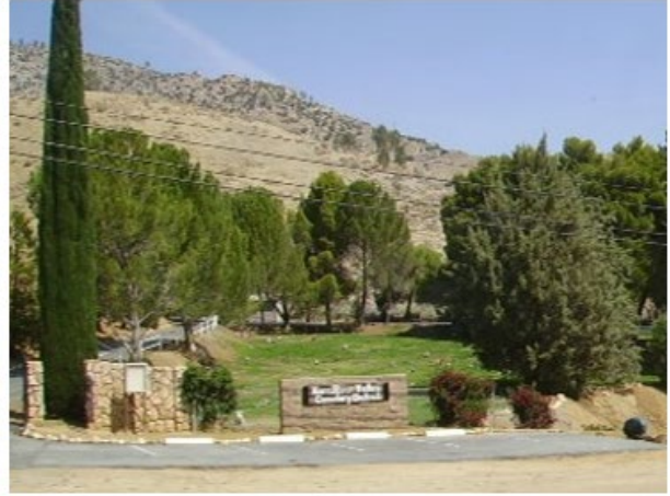
Public Cemetery Section