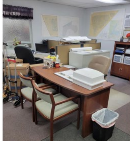
Consultation and Sales Area