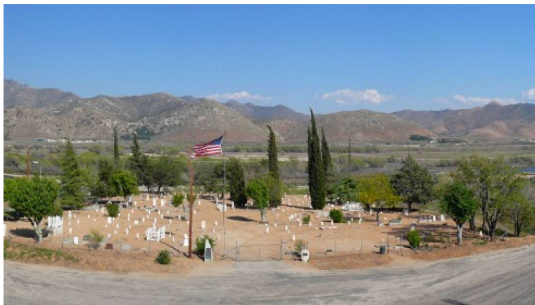
Panorama of Kern River Historical Cemetery

Have you considered taking a step back in time to enjoy the beautiful Kern River and its valley, surrounded by the Sierra Nevada Mountains, which first attracted Native Americans and early settlers? If so, then you should visit the Kern River Valley Public Cemetery District (District) and the intriguing Kern River Historical Cemetery (Historic Cemetery) overlooking the Kern River.