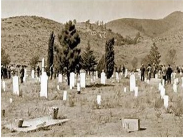
Historic Cemetery Section