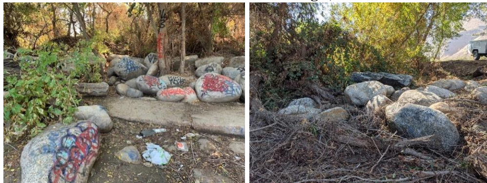
Hart Park Work Request July 2021

The perfect canvas for large scale paintings include: