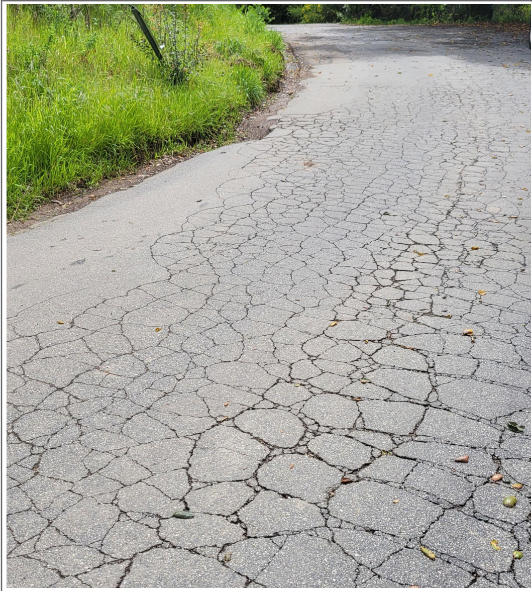
Figure 2. Mountain Charlie Road - PCI 16/100. [8]

To make matters worse, our County, for reasons that will be discussed, is in poor financial straits to the point where deferred maintenance of our road network is into the hundreds of millions of dollars and climbing. The County has lacked the financial resources to fix and maintain our roads using the general budget allocation. [4] As a consequence, the County relies on additional funding from outside sources. These include funds from Special District 9D 1-3 (1983), Measure D (2016), California Senate Bill 1 (SB1) (2017) and the most recent Measure K sales tax increase (2024). All these sources of funding help, but still leaves the County with a large funding shortfall. Most of this funding is allocated through formulas and the County has little discretion with how it can be spent.