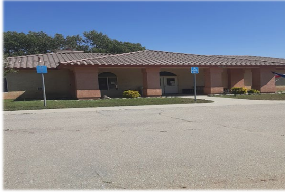
New playground equipment and CSD Library