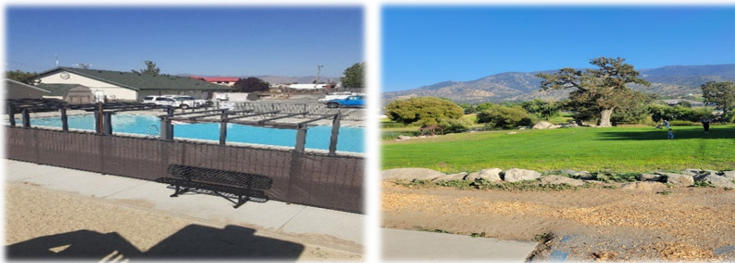
CSD pool and Horsethief Park picnic area – pictures taken by Grand Jury

The CSD provides water, trash, green waste, sewer, police, road maintenance, snowplowing and weed abatement. It also has a Parks and Recreation department with a pool, gym facilities and a lake for fishing. New playground equipment was gifted from a neighboring community with a Proposition 68 Grant for both Horsethief and Man O'War parks. A library staffed by volunteers is in a new facility at the edge of town. Although the fire station is owned by the CSD, it is staffed by the Kern County Fire Department.