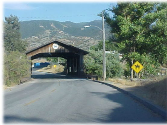
Stallion Springs Oktoberfest and iconic Covered Bridge