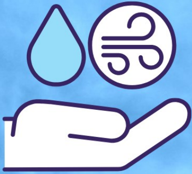
Air and water quality