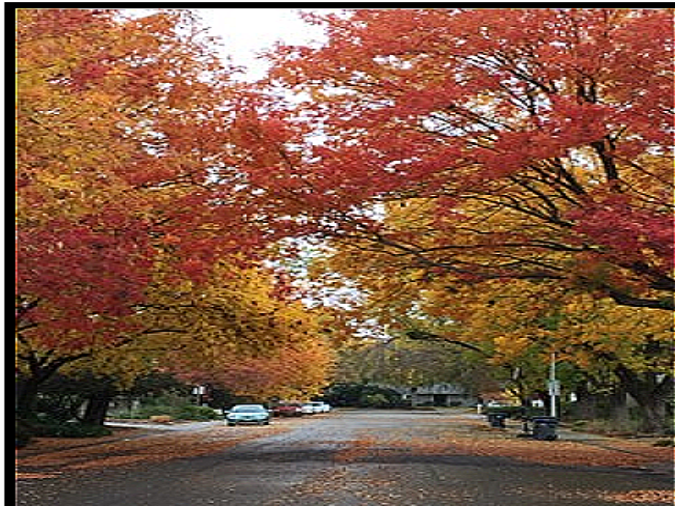
Davis trees