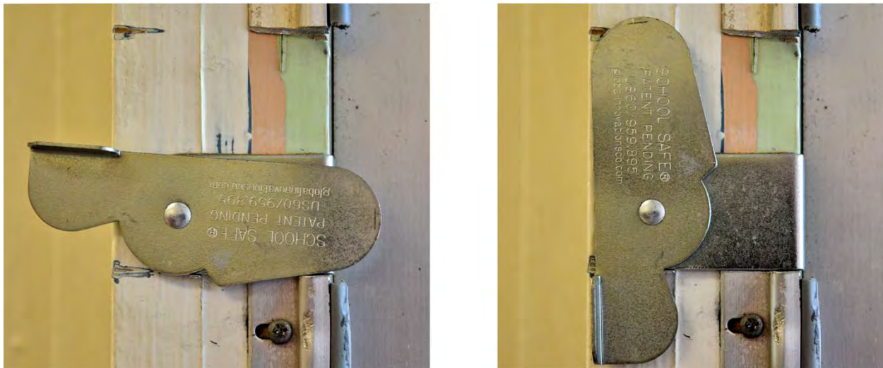
Figure 1. The inexpensive door security device installed on Wheatland Elementary School's door jams. Most school doors open to the outside and can be locked with a key only from the outside, a risky action in the event of a school invasion emergency. To use this device, the door is kept locked from the outside. When the device is in the position shown on the left, the door, closing from the right, is held slightly ajar and, therefore, does not latch. When the device is flipped to the position shown on the right, the door can be pulled completely closed and latched.