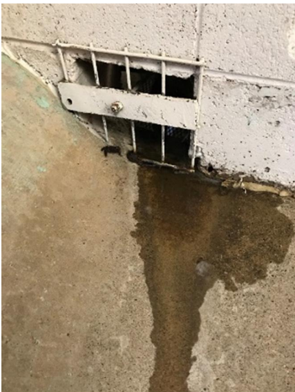
Fig. 1 - Floor drain in dog kennel area

The animal shelter continues to be a low priority for County leaders. There are currently 34 cat kennels. This is insufficient during the three kitten seasons per year and emergencies. There is inadequate ventilation in the feral cat section resulting in an extremely unpleasant odor which was evident during the CCGJ tour. Drainage is not up to code. The drain to the outside is an approximately three to five-inch hole in the cinder block (Figure 1). This inadequate drainage results in the water flowing back from the outside into the feral cat area during heavy rains (Figure 2). There is no proper drainage for the cleaning of urine and excrement from the dog kennels. Although the kennels are cleaned daily with anti-bacterial agents, due to the cracks in the concrete, bacteria cannot be completely eliminated (Figure 3). When hosing down the kennels the water flows through the dog enclosures into a drain at each end of the kennels (Figure 4). This has the potential to spread disease to the dogs.