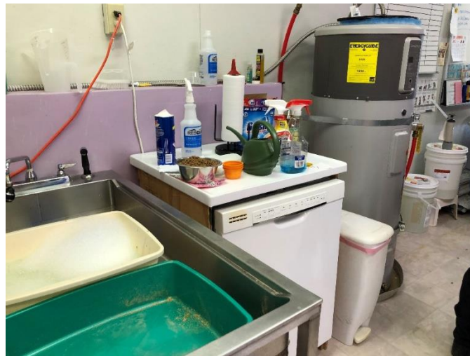
Fig. 5 - Work area

The shelter is very uninviting to the public. There is no curb appeal, no landscaping and paint is peeling off the exterior of the buildings. Buildings are small, workspaces are cluttered, and storage space is inadequate (Figure 5).