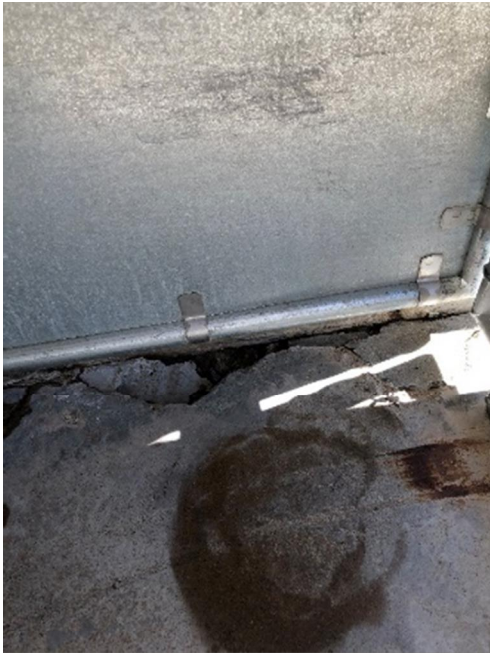
Fig. 3 - Crack in floor/wall - dog kennel area