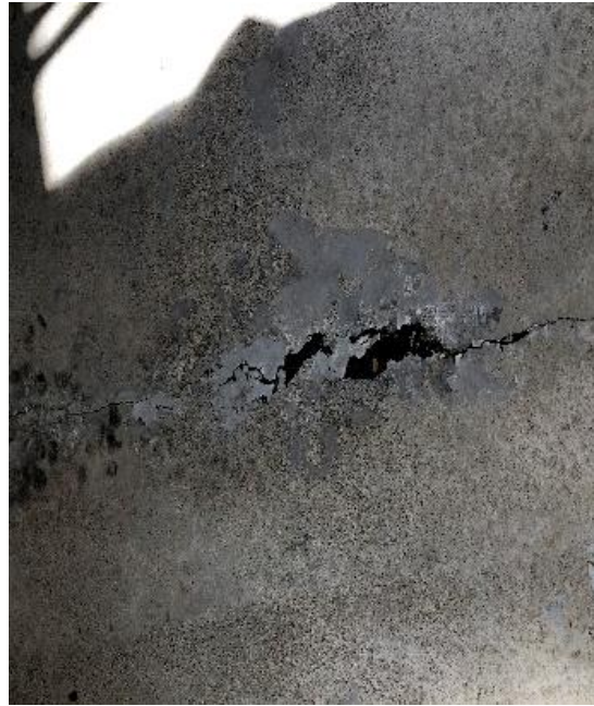
Fig. 4 - Hole and crack in dog kennel floor

The outdoor play/socialization area for dogs is insufficient. It is too small and void of exercise opportunities. The large animal area consists of moveable panels and has no shelter/barn for livestock.