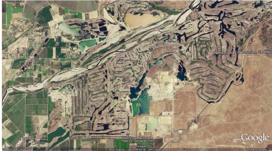
U. S. Geological Survey

Hydraulic mining in 1852 and 1893 changed the landscape and defined the current area. The area is now dominated by the tailings from the hydraulic mining. Gold dredging of the tailing began in 1902 and continues to the current time. Removal of aggregate is a major industry in Yuba County.